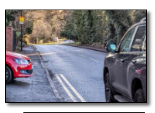
Cokes Lane, above, heading towards Harewood Road, where the new MVAS clearly shows a driver totally ignoring the warning to SLOW DOWN!

• a total of 5,719 vehicles were recorded travelling towards the White Lion Road, of which 15.7% were travelling at 35-50 mph;