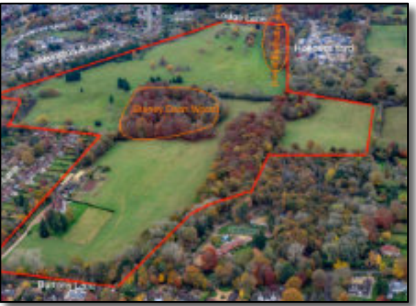
The green belt site proposed for development (boundaries shown approximate), and the ancient woodland affected.

1,085 Little Chalfont residents submitted their own objections to the proposals. In February 2022 the developer sent further information to Bucks Council on environmental aspects of the application. We then submitted comments reinforcing our